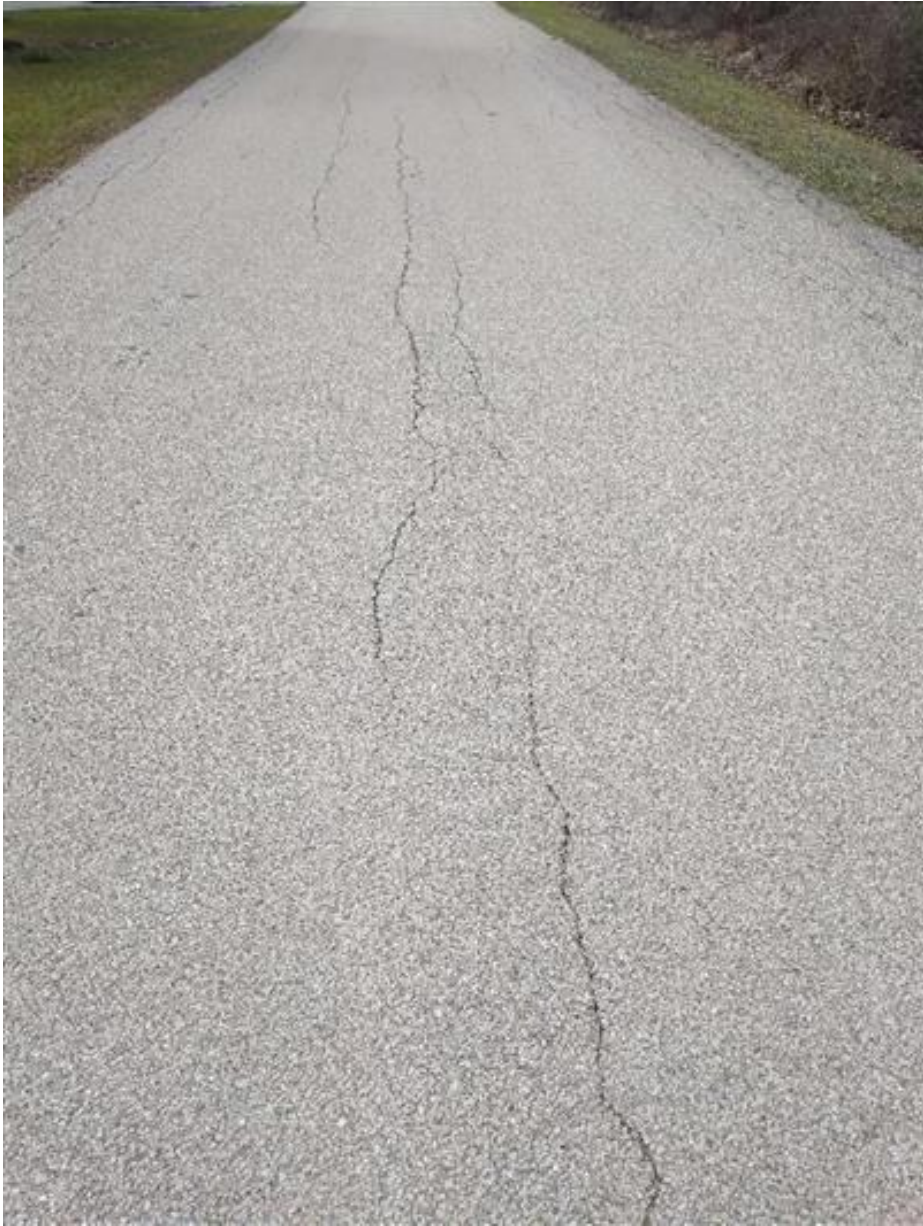
Distress Type: Longitudinal Cracking