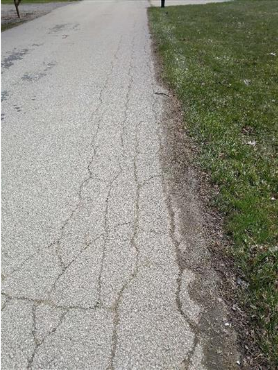
Distress Type: Edge Cracking