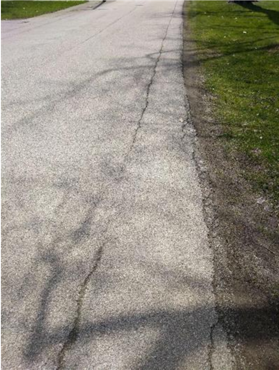
Distress Type: Edge Cracking