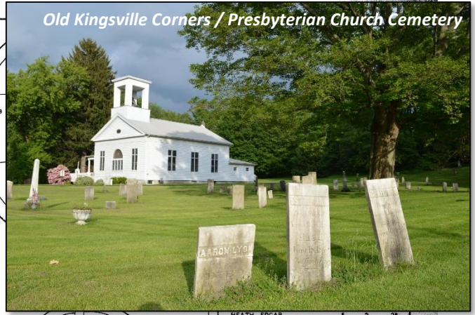
Old Kingsville Corners / Presbyterian Church Cemetery

Kingsville Township maintains 2 cemeteries, one active and one inactive. The Kingsville Presbyterian Church or Old Kingsville Corners Cemetery has 230+ gravesites. Lulu Falls Cemetery is an active cemetery and has 2,200+ gravesites. The cemeteries cover around 10 acres of land in total.