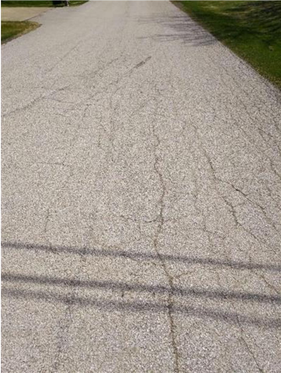
Distress Type: Map Cracking