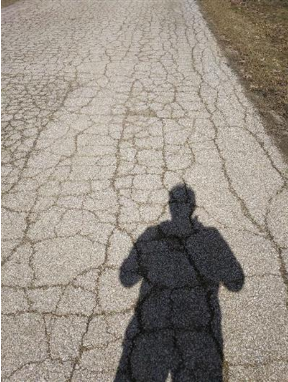
Distress Type: Map Cracking