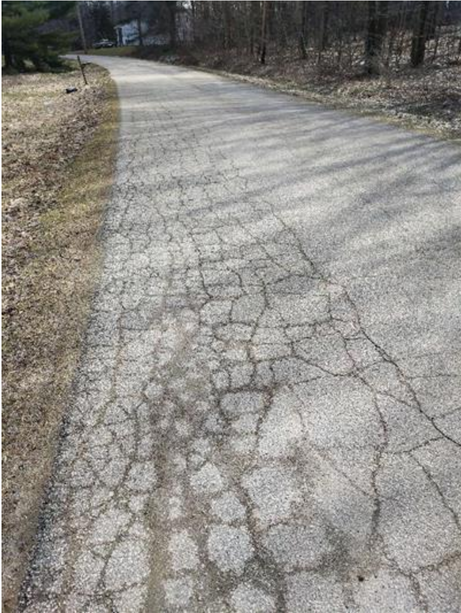
Distress Type: Map Cracking