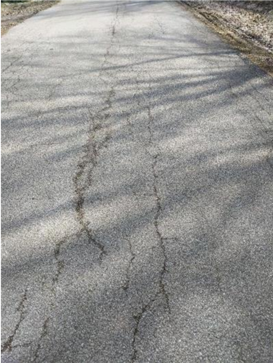
Distress Type: Longitudinal Cracking