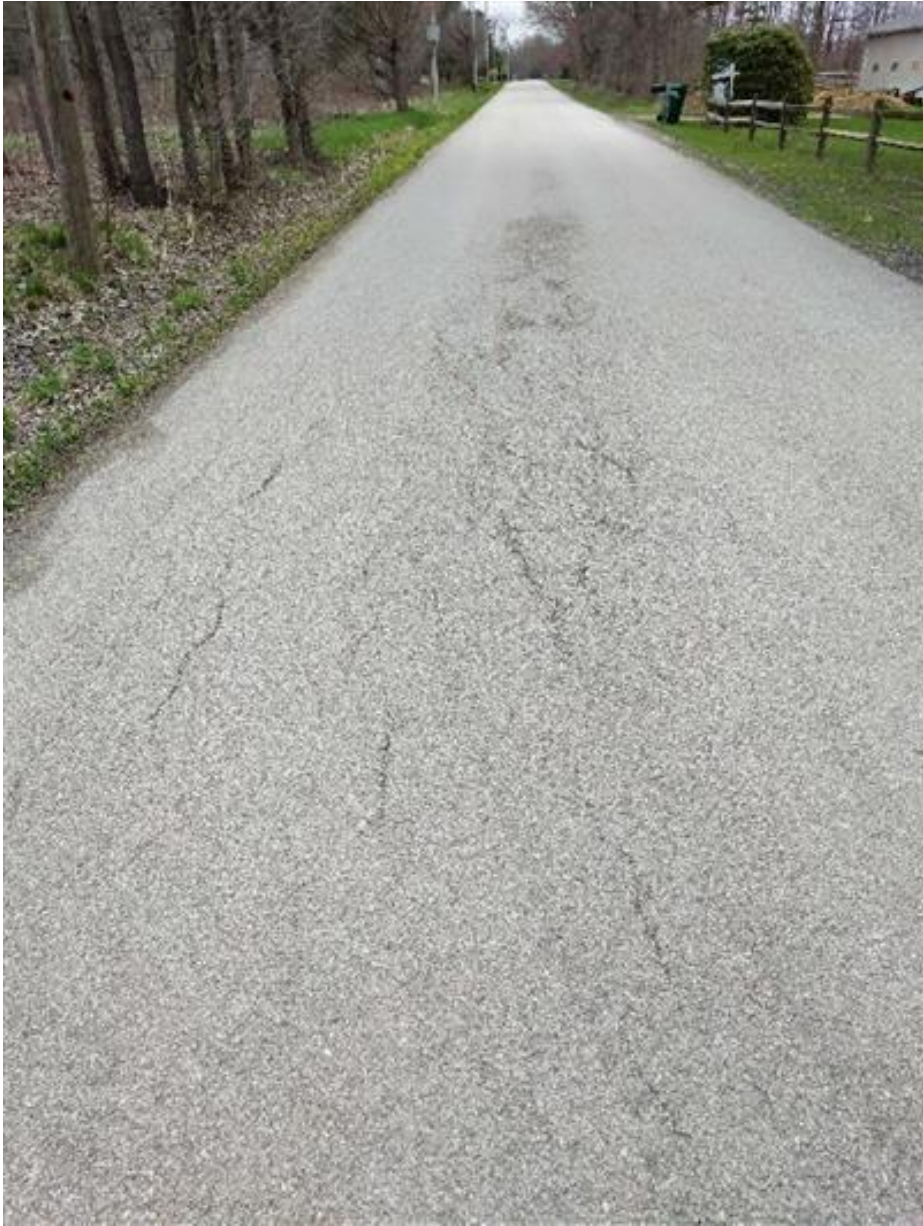
Distress Type: Longitudinal Cracking