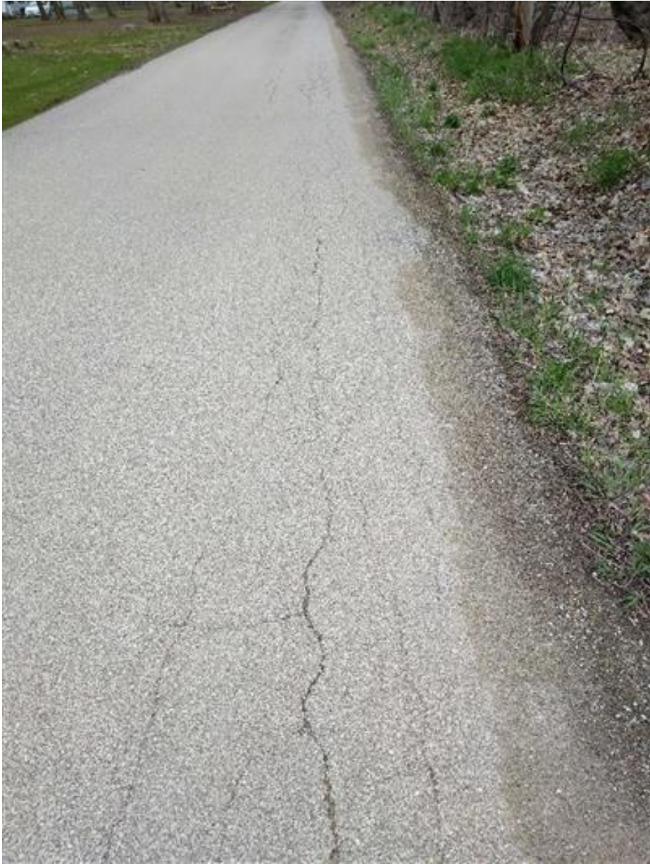
Distress Type: Edge Cracking