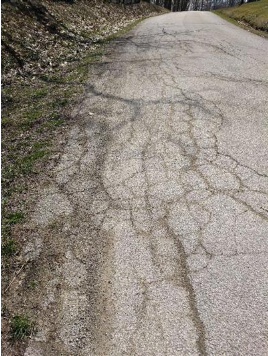
Distress Type: Edge Cracking