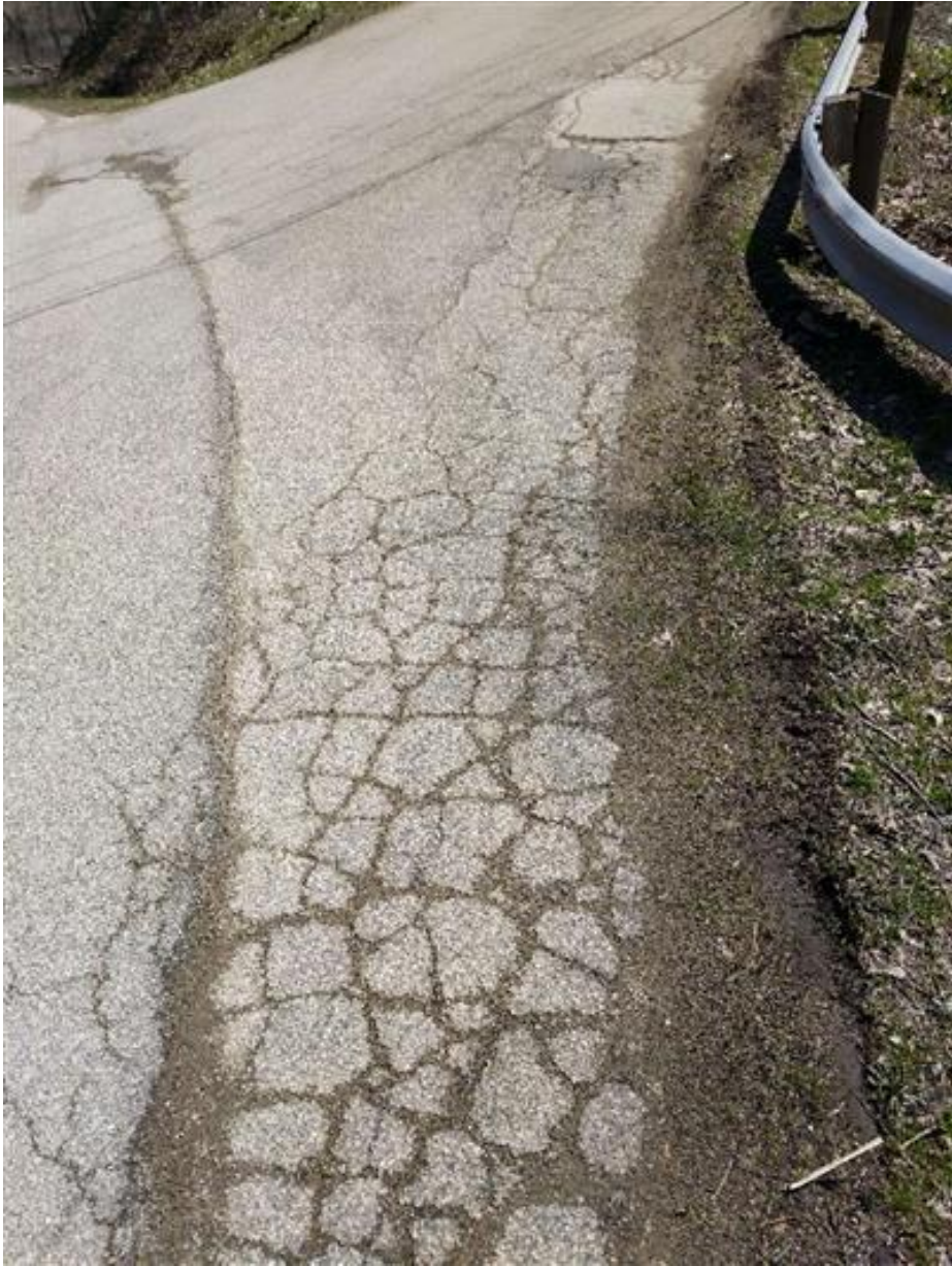
Distress Type: Map Cracking