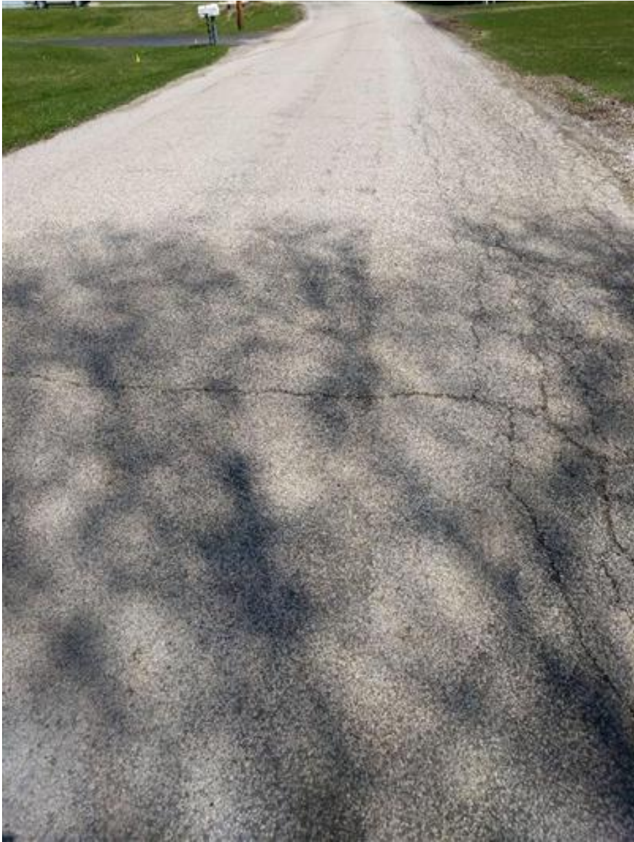
Distress Type: Transverse Cracking