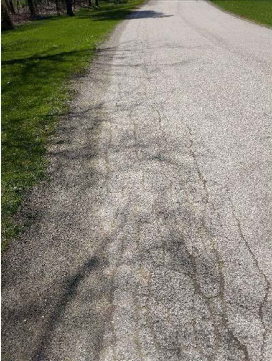
Distress Type: Edge Cracking