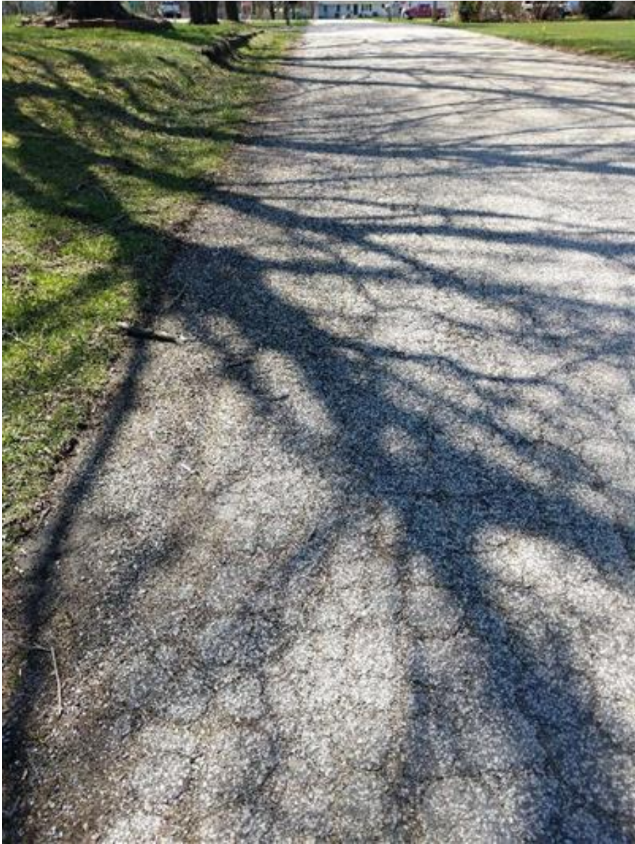
Distress Type: Edge Cracking