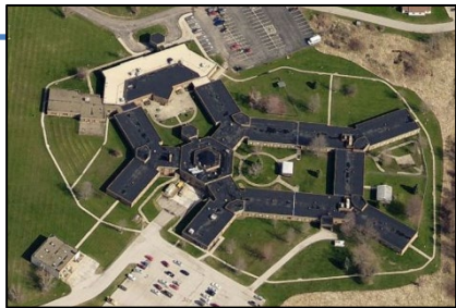
Ashtabula County Nursing Home